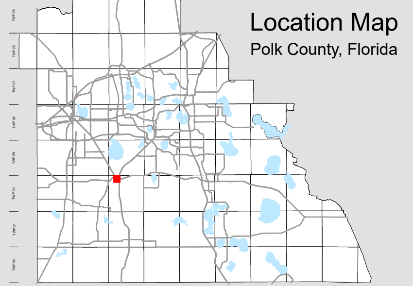
Location Map Polk County, Florida

Prepared by the office of the Polk County Property Appraiser Polk County, Florida 255 North Wilson Avenue - Bartow, Florida - 33830-3951 (863) 534-4777