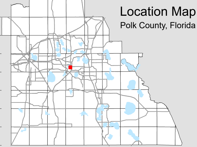
Location Map Polk County, Florida